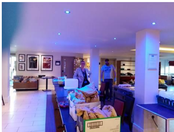
Figure 7 ELA Volunteers

They also continue to support social workers across Northamptonshire with appeals for food parcels, furniture, befriending and welfare calls. You name it we will be there, including our Facebook appeals and requests for kindness in the community.