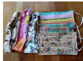
Figure 8 Face coverings

We also received some wonderful donations of masks from Audrey Pearce, a local Northampton Scout Leader. It’s been wonderful to see all our organisations and local groups coming together.