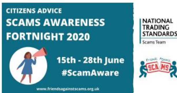
Figure 10 Scam Aware

The 2020 Scams Awareness fortnight starts on Monday 15 th June.