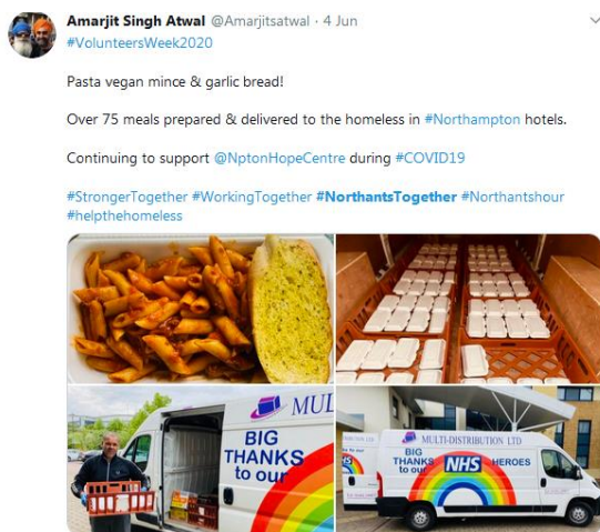
Figure 4 Northants Together tweet

Don't forget, we would love to see pictures of you helping those in need especially if you're wearing your pink hi-vis! Please always ask for permission before posting pictures of others and make sure that people are practising social distancing in any images you send us.