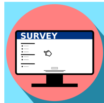
Figure 1 Survey

The response of volunteers within Northamptonshire has been outstanding. We cannot help and assist our communities without the support of volunteers, whether this is via the existing groups, new community groups or from the 14,000 pop-up volunteers who came forward to help due to COVID-19.