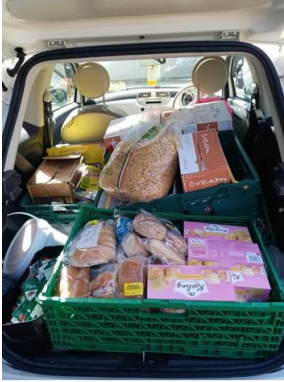
Figure 9 Donations from shop zero

Shop zero have been one of our donors week in, week out, supporting our missions. This has been a great partnership in helping those in need while also avoiding food going to landfill.