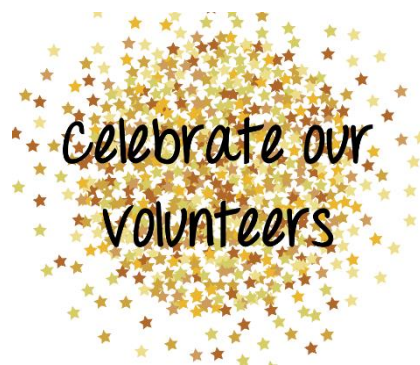
Figure 6 Celebrate our volunteers

To celebrate the work that so many volunteers are doing during this pandemic to help their neighbours, Northamptonshire ACRE is launching Northamptonshire's COVID-19 Community Champions. Groups across the county are invited to share details of the many ways they are supporting the more vulnerable in their community. Examples of support can be in whatever way a group chooses, whether through stories, photos, video diaries or brief statements and examples of the best community support will be brought together into a booklet celebrating Northamptonshire's volunteer champions. All entrants will receive a Community Champions certificate and will be invited to take part in a celebration evening Northamptonshire ACRE will host in spring 2021.